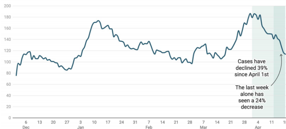
COVID Infections per 100K in Vermont (7-Day Average)

Source: Vermont Department of Health—April 19, 2021