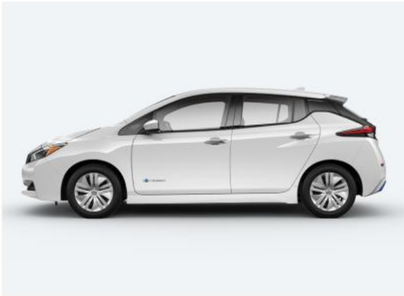
Great Savings on a 201... $5,000 discount or 0% financing

$5,000 discount or 0% financing on 2019 Nissan Leaf ($2500 for Leaf Plus)