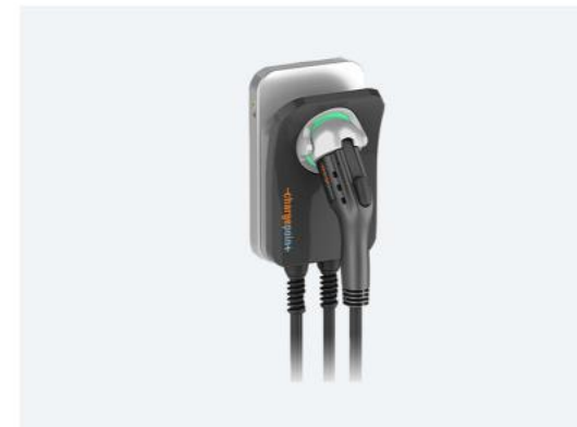
In-Home Level 2 EV Charger

GM employee discount for Volt and Bolt at Alderman's Chevrolet