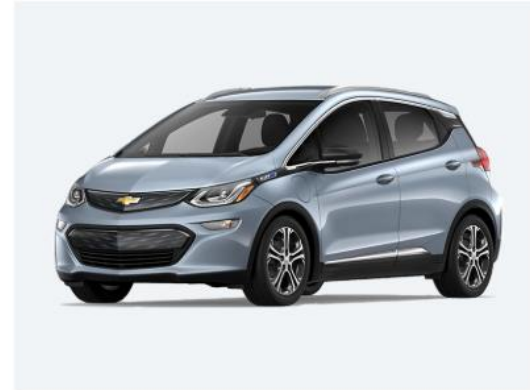
2018 Chevy Electric Vehicles

$5,000 discount or 0% financing on 2019 Nissan Leaf ($2500 for Leaf Plus)