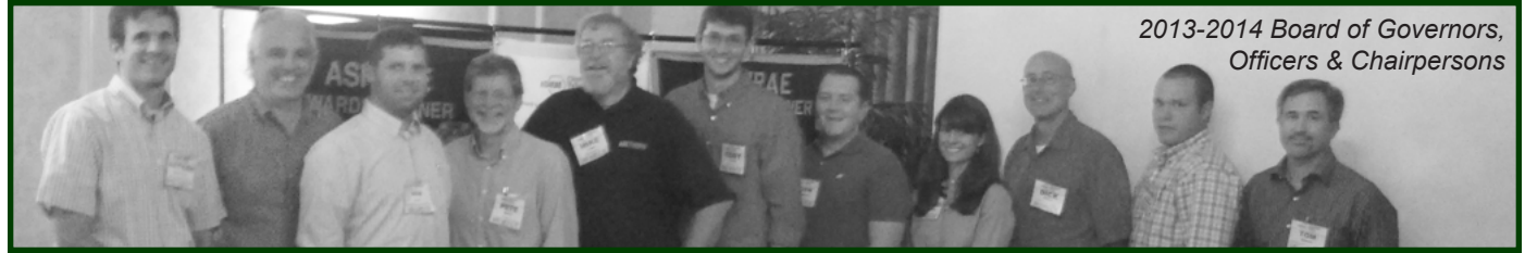
2013-2014 Board of Governors, Officers & Chairpersons

way through the House & Senate and was passed on BOG MEETING MINUTES