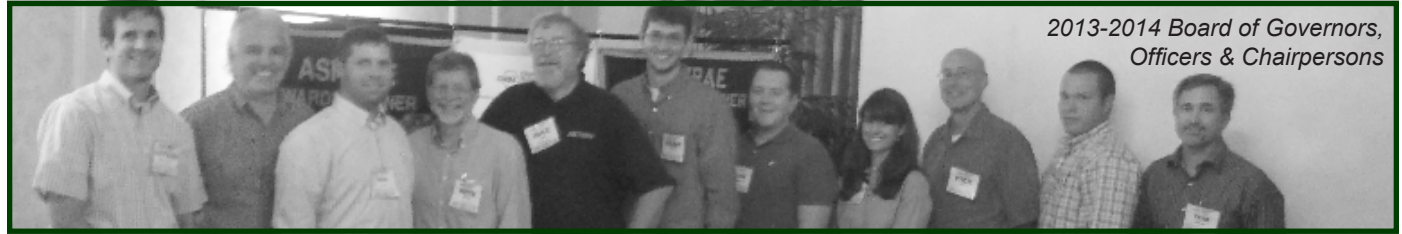
2013-2014 Board of Governors, Officers & Chairpersons