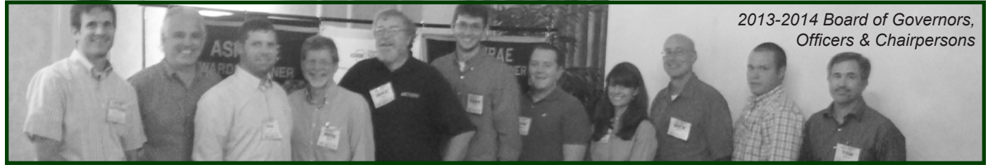
2013-2014 Board of Governors, Officers & Chairpersons