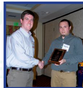
Chris Reilly Award